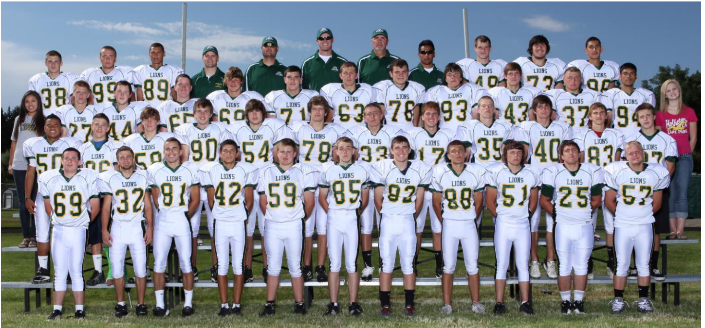
BORAH JUNIOR VARSITY TEAM PHOTO (see roster on Page 35)