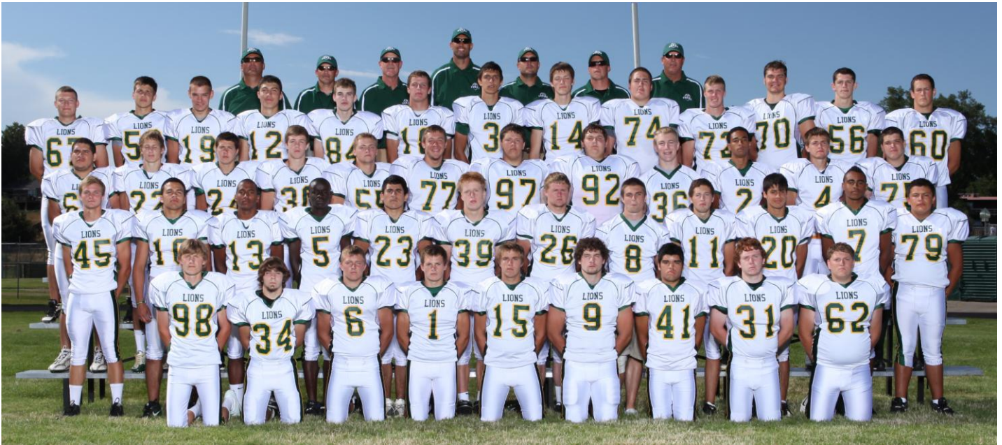
BORAH LIONS VARSITY TEAM PHOTO (see roster on Page 32)