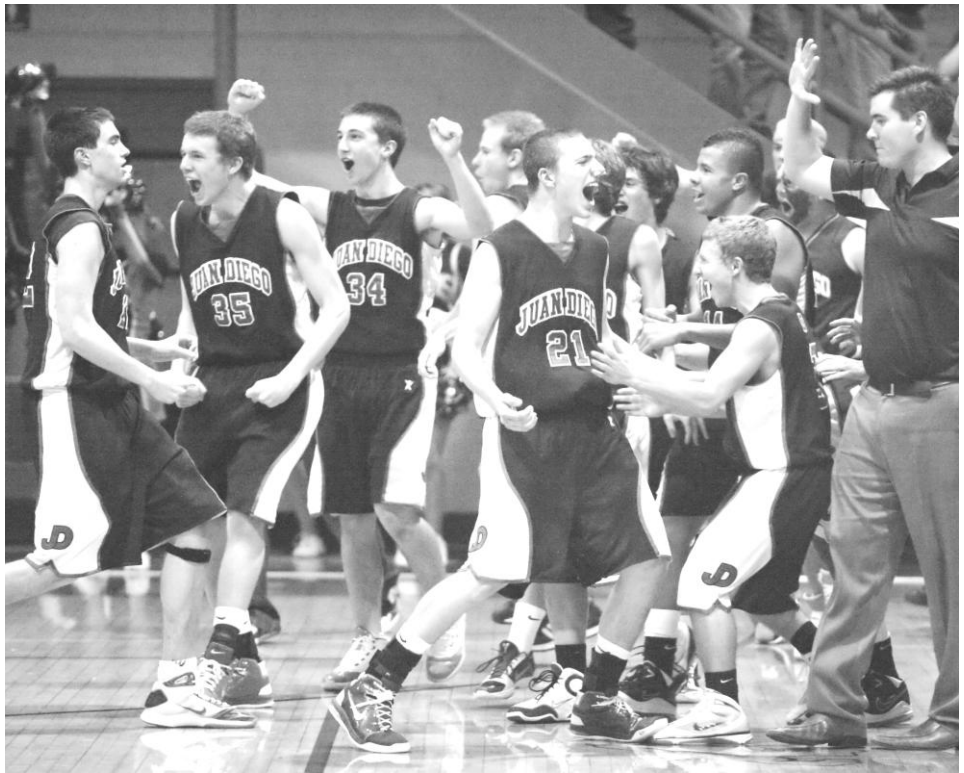
Juan Diego celebrates its biggest win of the season, a victory over rival Judge Memorial, which marked the first time it had won on Judge's home court.

region ended with just two wins out of five, and the Soaring Eagle finished with a 7-3 region record. That was still good enough for second place but, after the solid start, the team had higher goals.