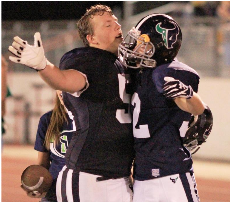
XXXXXXXXXXx and XXXXXXXXXXXXx give each other a celebratory chest bump near the end of Mountain View's season-opening win over Vallivue.