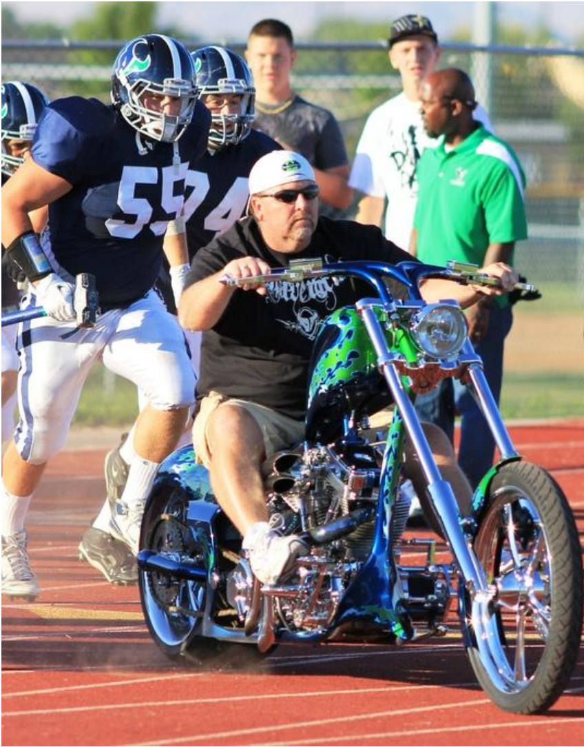
TOP LEFT: XXXXXXXXXXXXXXXX