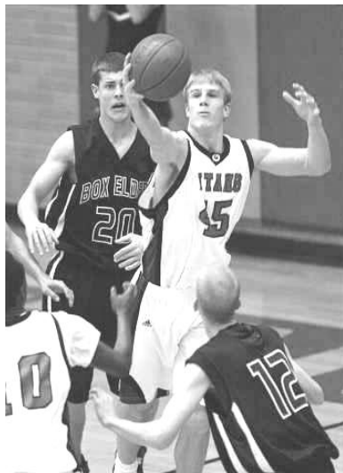
Continued from previous page